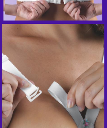
IDEAL FOR: STERNUM COMPRESSION BREAST RECONSTRUCTION BREAST SEPERATION