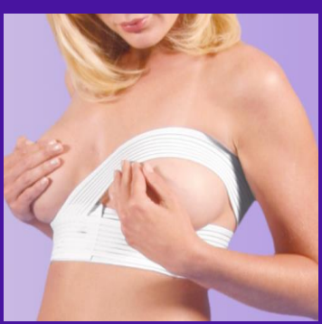
IDEAL FOR: BREAST AUGMENTATION BREAST RECONSTRUCTION STABILIZATION & POSITONING OF IMPLANT